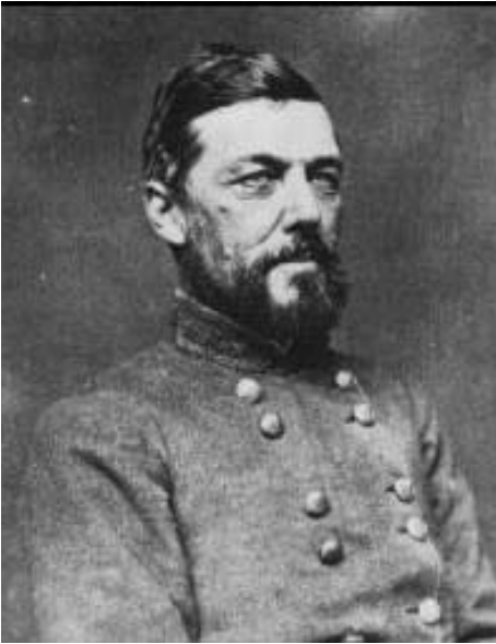
Brigadier General Thomas Fenwick Drayton, who commanded Confederate forces at the Battle of Port Royal Sound. General Drayton's family owned a large plantation on Hilton Head Island. 6)

south and proceed to attack Fort Walker from the north, its least defended flank. Unfortunately for DeSaussure's infantry, this was the side of the fort on which they were positioned. After passing slowly in front of the fort against the tide while maintaining a rapid rate of fire, the ships were to turn east and north, pass with another attack, and continue making passes until the destruction of Fort Walker was complete. DuPont's flagship, the Wabash , was followed by fourteen other Union war ships. Ironically, one of the Union ships, the Pocahontas , was commanded by Captain Percival Drayton, brother of Brigadier General Thomas Drayton, commander of the Confederate land forces at Port Royal. 41