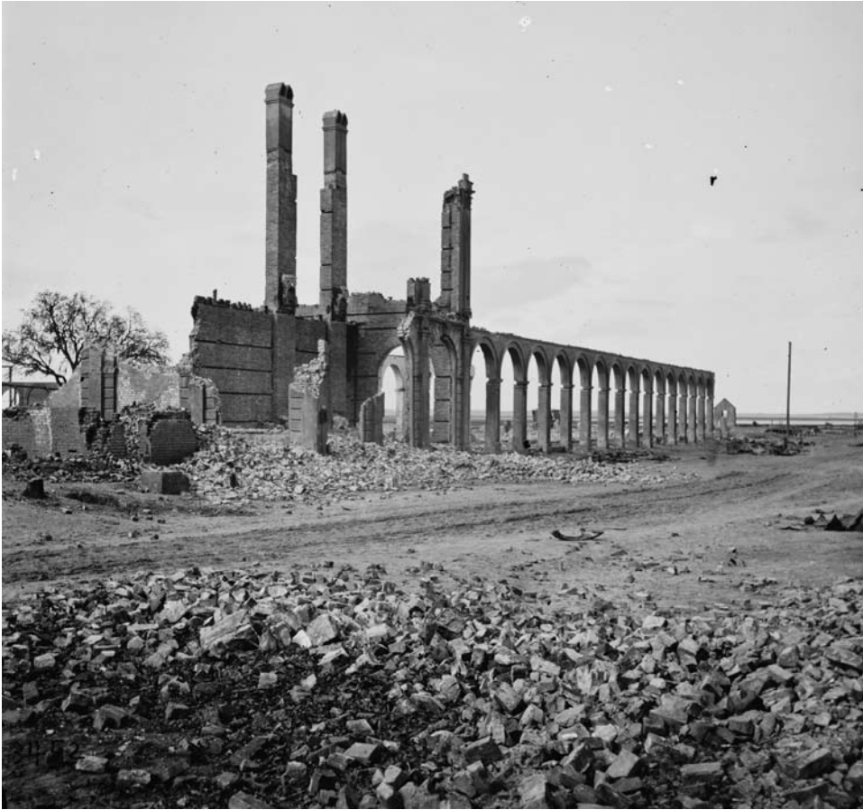
The Northeastern Railroad depot in Charleston after the explosion that killed hundreds of women and children. (10)

Charleston. Some artillery companies were decimated by desertions.” Lee hoped Hardee’s corps could make a junction with the Army of Tennessee in front of Sherman at Chester or, if that was not possible, could continue on to Chesterfield or Cheraw. 34